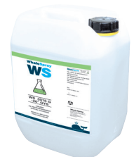
PN. 062511 Welding coolant - 5 l