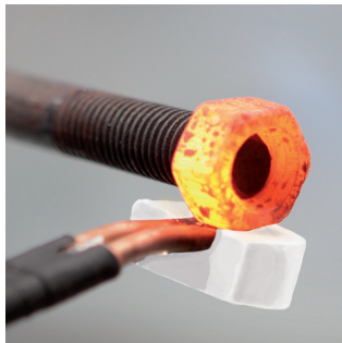
Releases rusted bolts