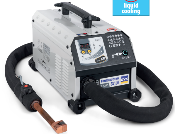
Supplied with a complete inductor 90°