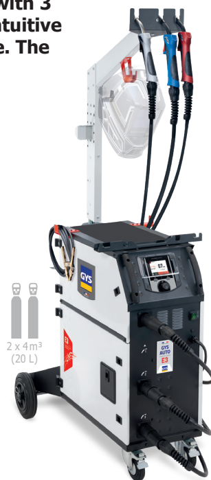
2 x 4 m 3 (20 L)